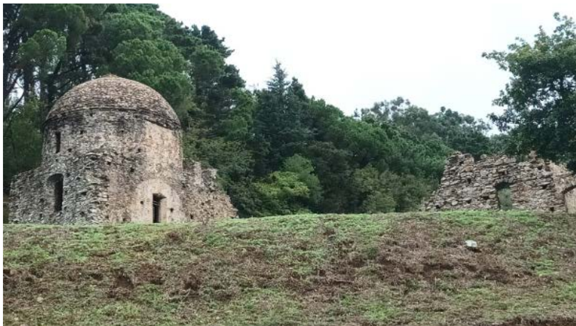
The Hermitage of St. Elijah-Curinga

Village Falkensteiner - Acconia di Curinga (CZ)